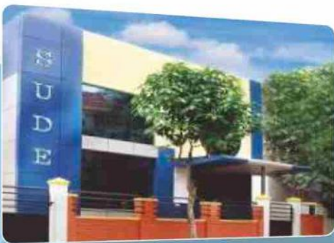
Registered Office, Bangalore