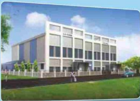
Factory & Branch Office, Pune