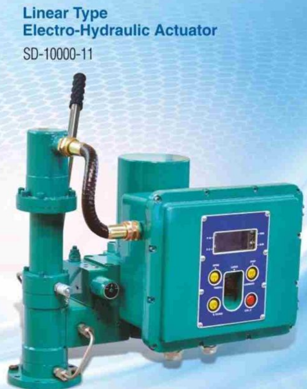
Linear Type Electro-Hydraulic Actuator SD-10000-11